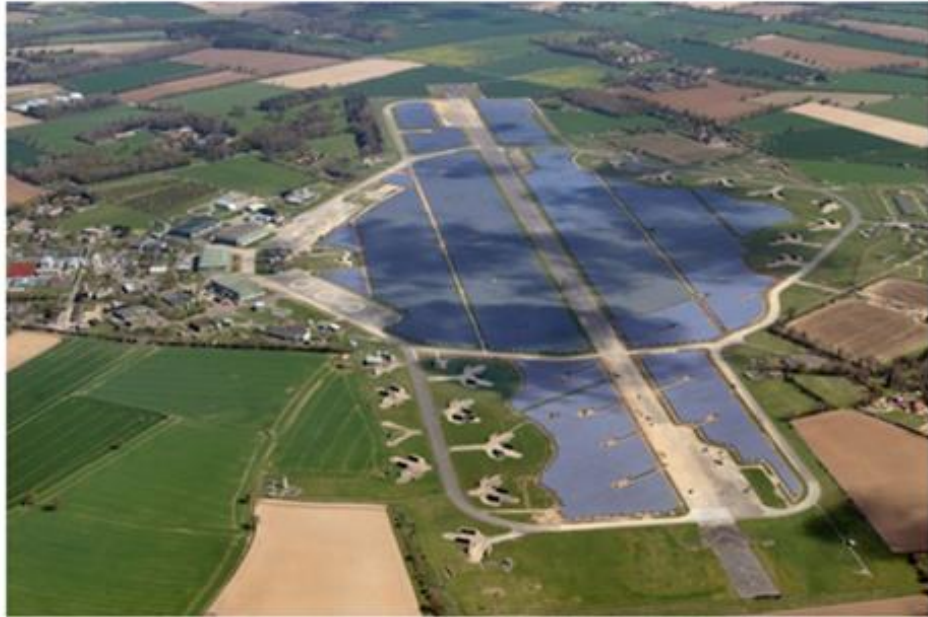
Scottow Solar Farm at Coltishall.